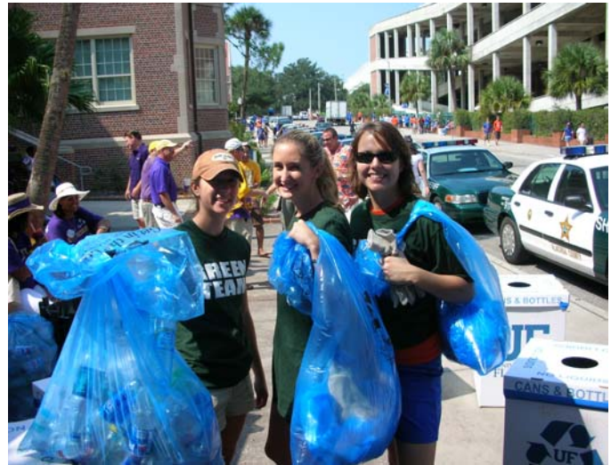
University of Florida Student Chapter Zero-Waste Tailgate, Fall 2006

WEF's Student Membership program has been operational for over 25 years and has over 1,000 participants. The program was created for those students who are regularly enrolled in colleges, universities, or other technical programs and spend at least one-half of their time on academic course work or equivalent. Over the years, WEF has expanded and improved upon the services offered to its Student Members in an effort to enhance and facilitate both their current studies and their transition into the working environment.